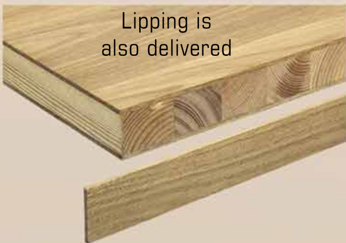
Lipping is also delivered

Selection offered: Oak without knots, Oak with saps, Oak rustic, Beech with and without filling, Walnut, Acacia long steamed, Acacia short steamed, Maple without knots but with particles, Birch with and without knots, Elm, Bamboos, Pear, Cherry.