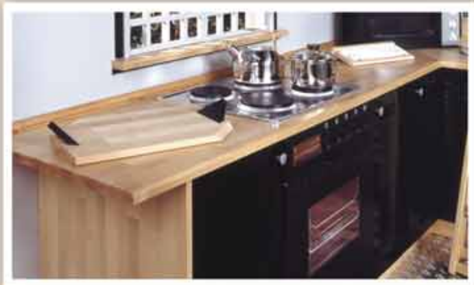
Solid stable Plywood-Boardings are ideal for kitchen working surfaces.