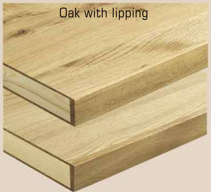
Oak with lipping